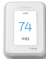
T10+ & T10

The Pro app is designed to work with the T5, T6, T9, T10, and T10+ thermostats (WiFi connectable SKUs only).