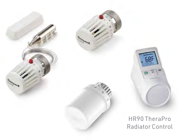
T100 Series Standard Capacity TRV Actuators