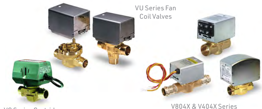
VC Series Cartridge Cage Valves

Our advanced Zone Valve portfolio has set the industry standard for reliability, service and installation convenience. Choose the exact, size, voltage, opening characteristics and fitting options you need for the job.