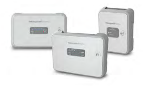
HPZC & HPSR Hydronic Pro Zoning Panels