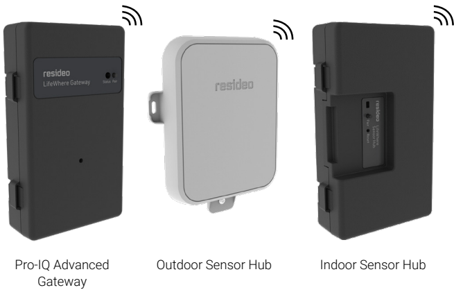
Pro-IQ Advanced Gateway