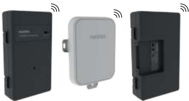
Pro-IQ Advanced Gateway Outdoor Sensor Hub Indoor Sensor Hub