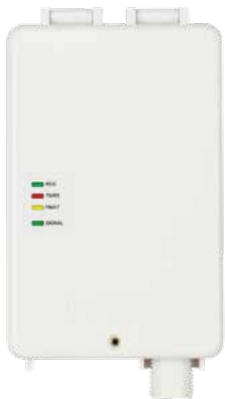
LTE Communicator Upgrade

You can earn up to a $55 credit to your ADI account.