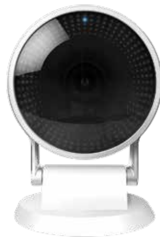
Video Storage Upgrade

Upgrade from the Security Package to Smart Security or Smart Home Package