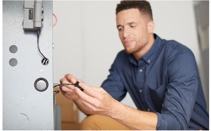
Pro-IQ LifeWhere is easy to install.

Smart for customers, invaluable for your business.