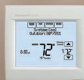
VISIONPRO® 8000 SMART THERMOSTAT