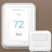
T10 PRO SMART THERMOSTAT