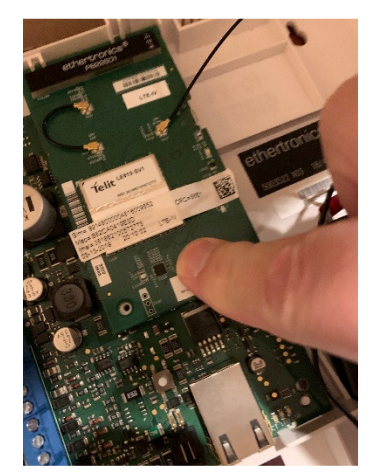
Figure 4 Figure 5

13. Reinstall the two screws to secure the Cellular PCB. Refer to Figure 6